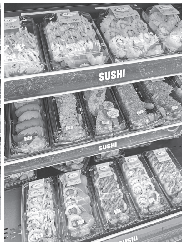
Fresh-made sushi is now available at DiMino's Lewiston Tops at 906 Center St., Lewiston.